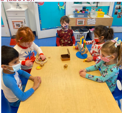
Academy Preschool children at Stone Mill's campus enjoyed a fun pajama party and learned about Hanukkah while the Pre-K children wrapped gifts for their families and hosted a Toy Drive for Children's National Hospital (above)!